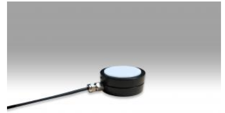
Illuminance detector head VL-3707

The detection of the very small signal currents produced by the VL-3707 at low illuminance levels requires suitably matched low-level detection electronics. For this purpose Gigahertz-Optik offers their P-9710 Optometers. The transimpedance amplifier of the P-9710, in conjunction with its 16-bit ADC, provides a noise level in the range of femtoamperes ( 10^{-15} A), which provides a sufficient signal-to-noise ratio even for illuminances of 100 \mu\text{lx} . Equally important is the electronically adjustable offset adjustment at the signal input, which minimizes the effects of detector dark current signals. The offset adjustment function is also available via the RS232 interface. Due to the eight switchable amplification stages, the