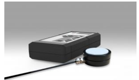
Luxmeter for very low illuminance levels consisting of optometer P-9710 with photometric detector head VL-3707.